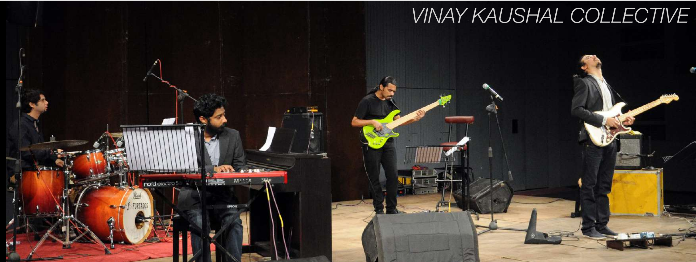
The VK Collective performing at the Experimental Theatre, National Center for Performing Arts, Mumbai

The Vinay Kaushal Collective was created to bring a high-level of energy, and musicality to corporate and private events. The Collective embraces a cross section of musicians with a singular passion for creating music that is vibrant and new while still staying true to the influences of jazz, blues and world music.